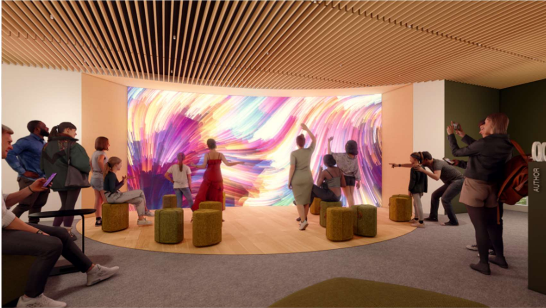
2 Immersive Theater Concept Rendering, Snøhetta