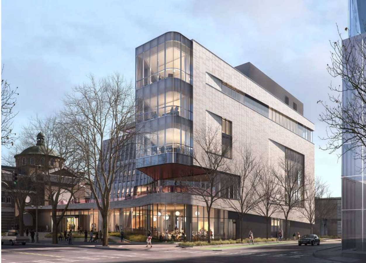
1 Charlotte Mecklenburg Main Library Rendering, Snøhetta